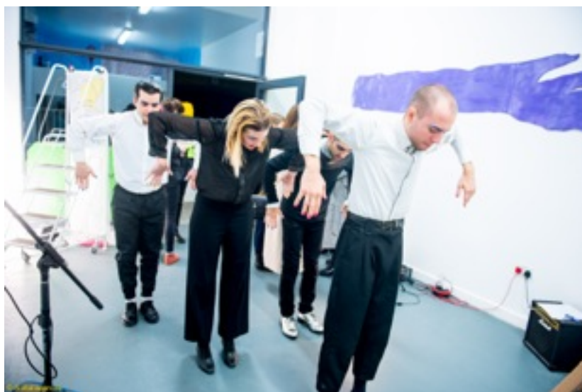
Trailer for a Remake of Chorus for Four

Further information about the project and the artists: